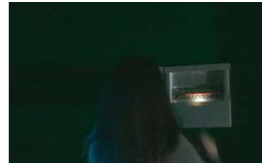
Your enclosure can be fitted with a marker light.

Your enclosure can be fitted with an attractively designed matching keylock ; this prevents children or non-qualified people from accessing the switchgear and avoids any risk of direct contact with live parts.